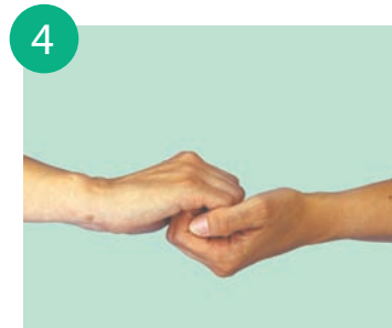
4 rub back of fingers on opposing palms with hands interlocked