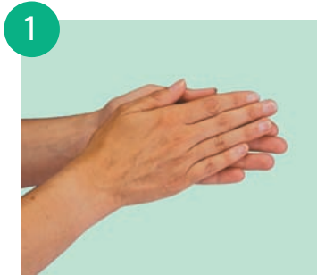
1 rub palm on palm

Standard handwash method in accordance with EN 1499