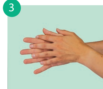
3 rub palm on palm with fingers interlaced