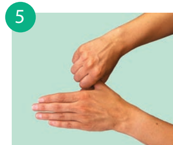
5 rub thumbs rotationally