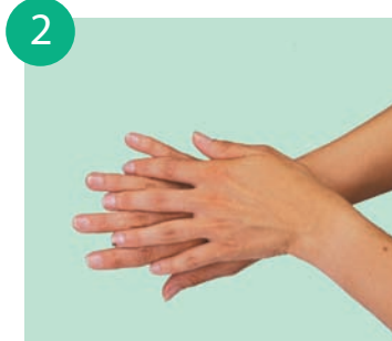
2 rub left palm over back of right hand and vice versa